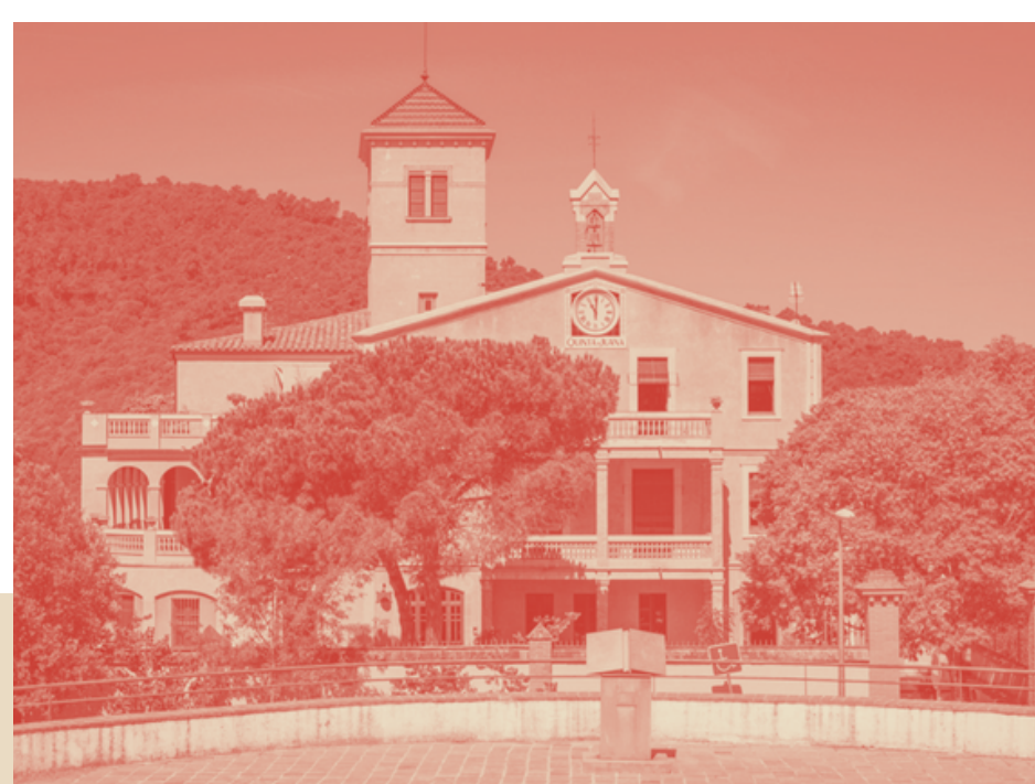
THE HOUSE – MUSEUM

The writers will be in contact with a person from PEN Català who will welcome them the first day and check in with them during their stay but will not live with them at the residence. Therefore, the writers must be autonomous when it comes to planning and managing their stay, as well as buying and cooking their own meals.